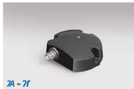
7A - 7T