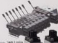
Proportional Directional Valve PDV117

Pump flow 260 l/min A/B work port flow up to 200 l/min Max working pressure 370 bar Electric reference signal: 0-10V, 4-20mA, CAN, PWM