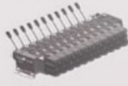
Proportional Directional Valve PDV74

Pump flow 160 l/min A/B work port flow up to 130 l/min Max working pressure 370 bar Electric reference signal: 0-10V, 4-20mA, CAN, PWM