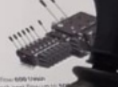
Proportional Directional Valve PDV170

Pump flow 600 l/min A/B work port flow up to 450 l/min Max working pressure 370 bar Electric reference signal: 0-10V, 4-20mA, CAN, PWM