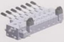
Proportional Directional Valve PDV37

Pump flow 90 l/min A/B work port flow up to 60 l/min Max working pressure 370 bar Electric reference signal: 0-10V, 4-20mA, CAN, PWM